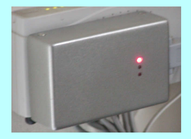
Floor selector located on top of Elevator car/ Machine Room

The system requires 5 V, 500 mA power supply.