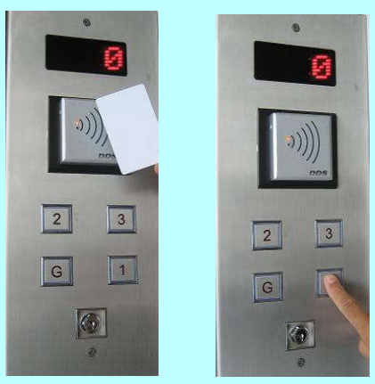
Access Control located inside Elevator car

For restricting access to floors, an additional unit "Floor Selector" is necessary.