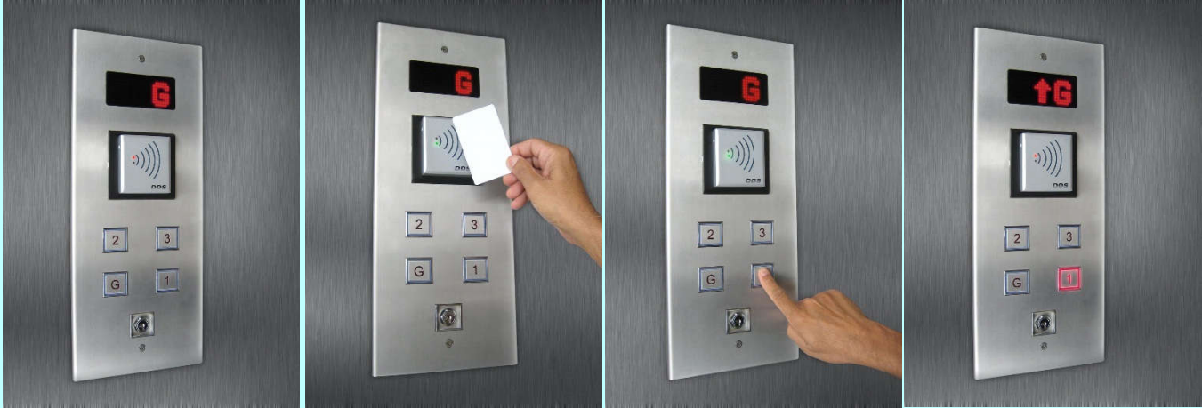
Only Authorized Card Holders can use the elevator to Authorized Floors

The residents register call to the authorized floor/s by flashing their card and then selecting the floor. Every floor call is recorded with cardholders ID with date time stamp.